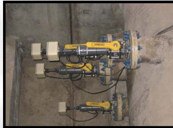
7655A Feedthrough Assemblies in FRP

For applications where only new Feedthrough assemblies are required, Flowmeter Services model 7655A Feedthrough assemblies are compatible with Accusonic® model 7565 transducers.